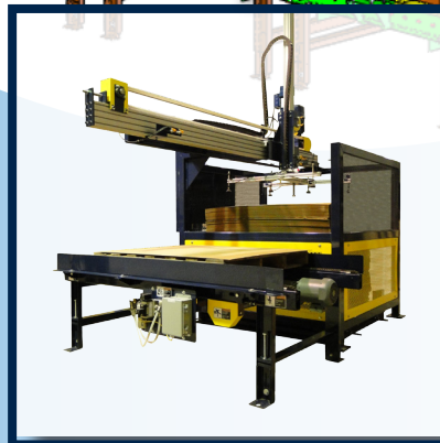
Pick and Place Feeding a Pallet on a Chain Driven Live Roller Conveyor