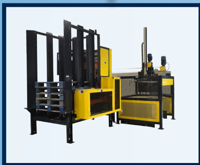
Pick and Place with Pallet Dispenser